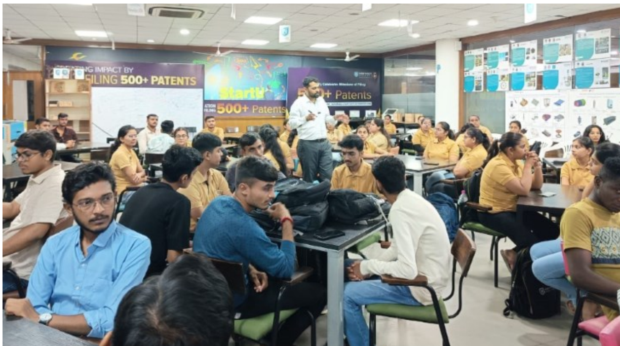
Glimpse of the Sensitization session on Innovation and Entrepreneurship for FoT & Science Students